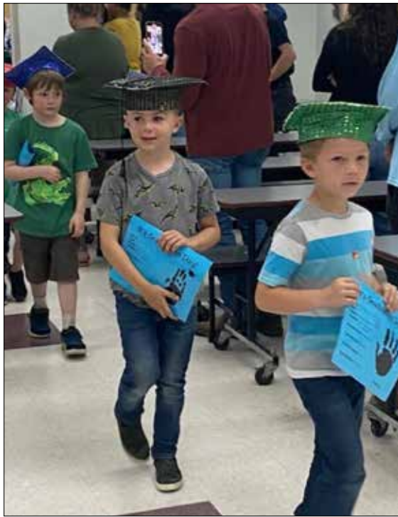
Kindergarten graduated to first grade.

We are looking forward to another great year ahead.