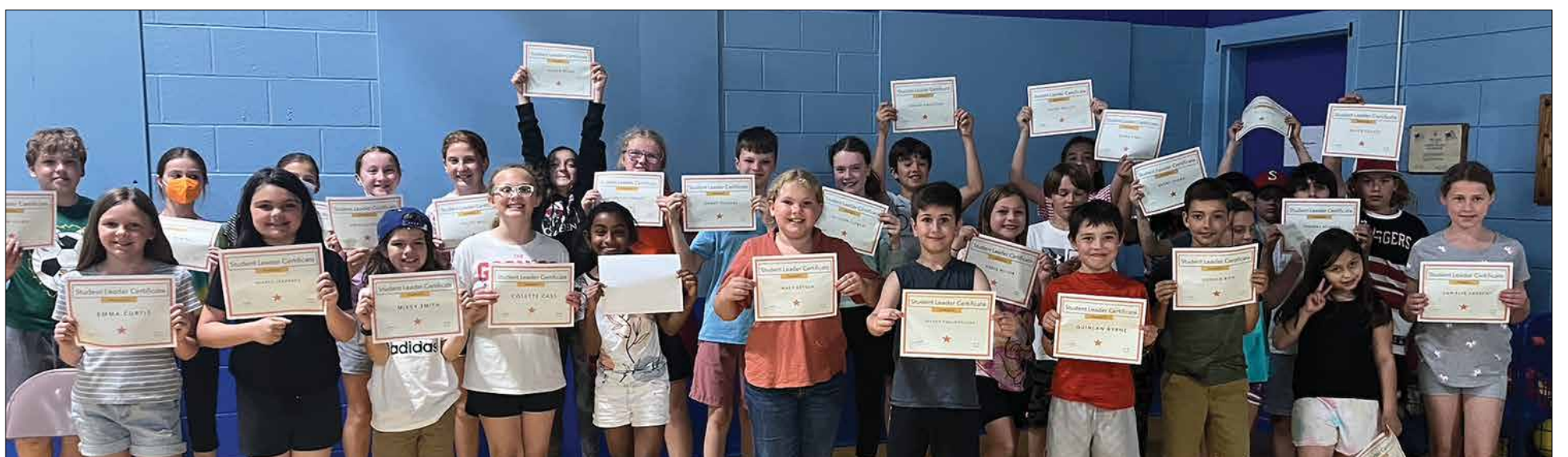
Weatherbee Student Leaders—Student Leaders were recognized in an all school assembly for their work this year. Some projects included Maine Day, the staff vs. students basketball game and supporting school wide efforts around appropriate behavior.