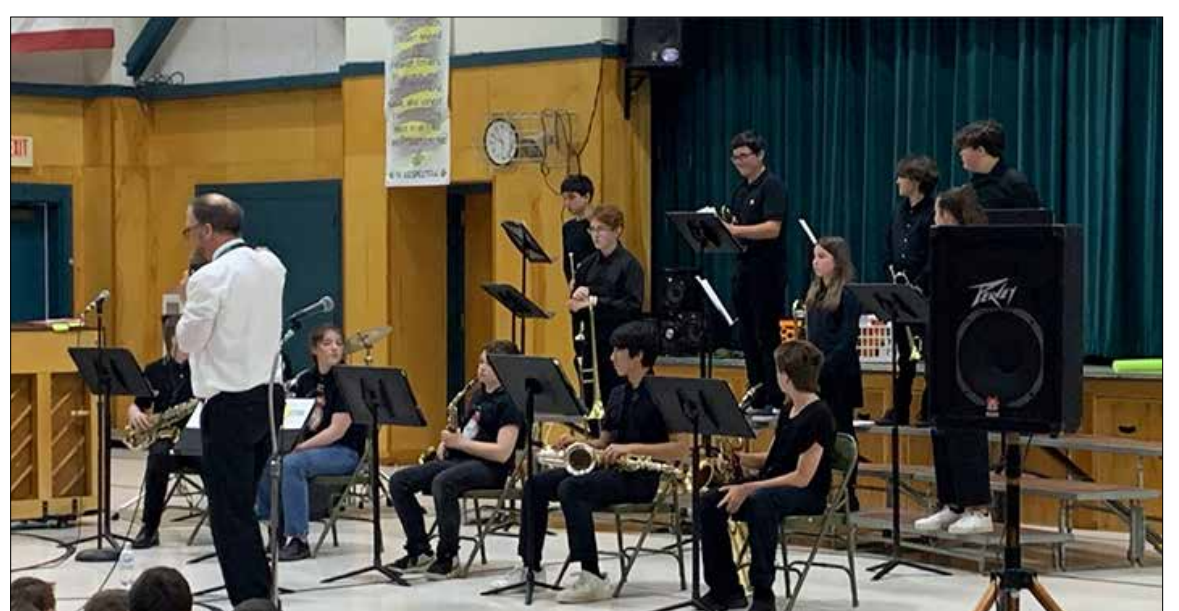
The Wagner band and chorus visited Smith, offering an amazing performance.