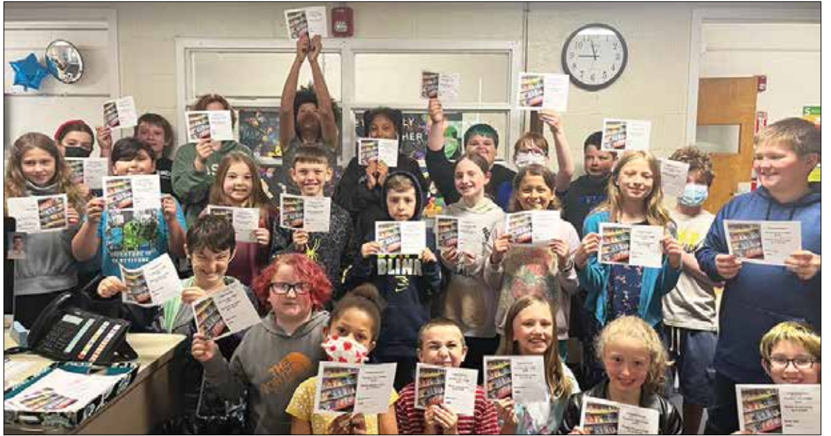
Excited Bobcats who were raffle winners of the PTO Spring Book Raffle!