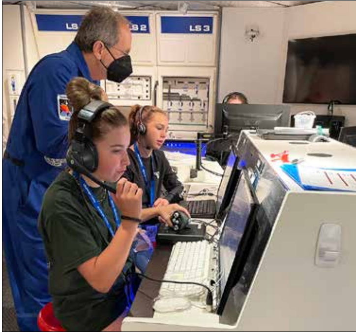
CHALLENGER LEARNING CENTER —The entire Wagner Middle School 7th grade attended the Challenger Learning Center in June. They performed a series of successful missions as a team, despite a two year Covid delay.