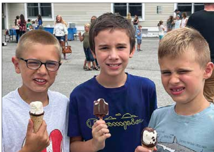
Students who completed VSS celebrated with an ice cream social Aug. 10 at Smith School.