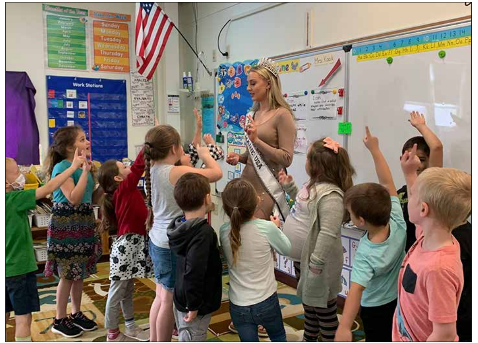
Miss Maine visited classrooms to talk about the importance of education.