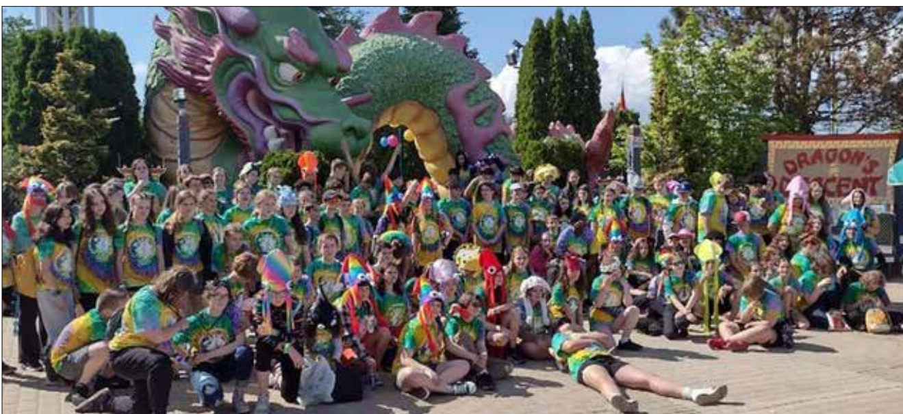
Above: 7th and 8th graders in the Wagner and Reeds Brook band and chorus enjoyed an end of year field trip to Fun Town Splash Town.