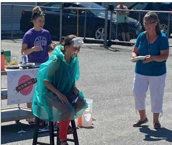
PIE in the Face