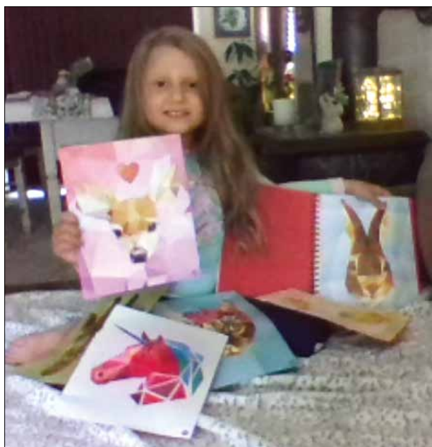
One student created images using her "Sticker by Number" book. She said the images look like stained glass.

perience for over 100 students. The four week program was run through Google Classroom. Weekly assignments were posted every Monday, starting on July 11th. Each weeks' assignments were due by the following Sunday. Students earned points toward the Virtual